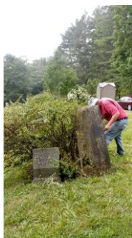
Invasive bush removal