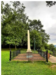
Cleaned & mulched