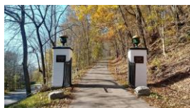
Cleaned & painted