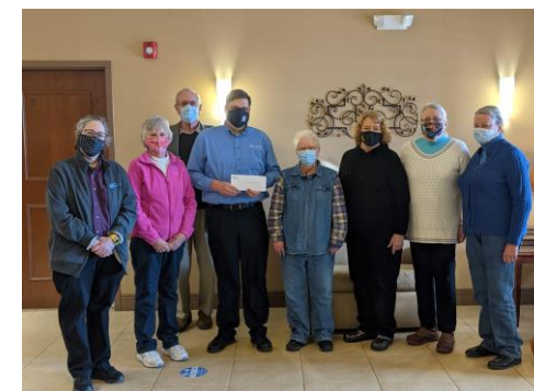
Tioga State Bank Foundation – Grant for Preservation & Restoration of stained glass at Evergreen Mortuary Chapel