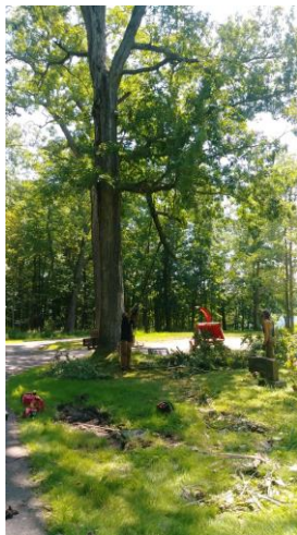
Dead Tree removal continues in 2022