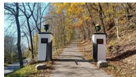
2022 Season Begins