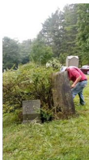
Invasive bush removal

2022 Work Days In Evergreen 9 am – noon Sign-in at the office building in the cemetery